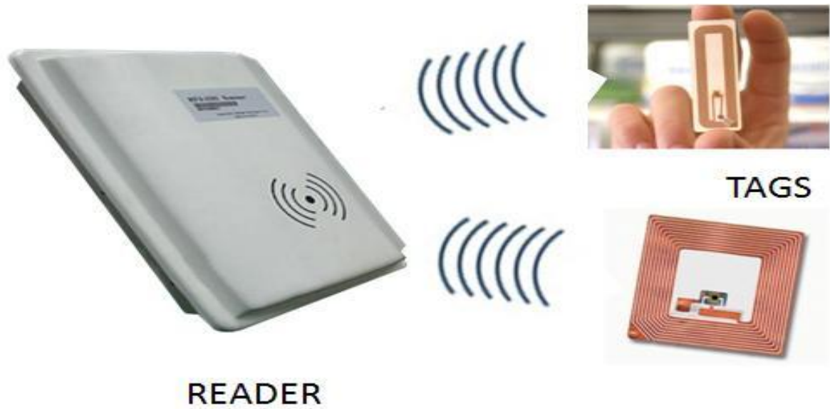
Fig 2.2. Images of RFID tags and reader